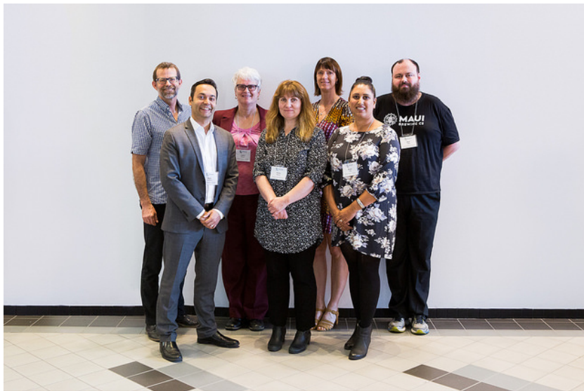
KPU OER grant recipients together with members of the Open Education Working Group, at the 2017 Open Textbook Summit.

KPU's leadership in open education is a product of both strong grassroots support across the institution and strong support from senior leadership. Internally, we owe much of our success to the diligent and thoughtful efforts of members of KPU's Open Education Working Group while externally, our close and ongoing partnership with BCcampus Open Education has been critical to our progress. Over the past three years, KPU's open education initiatives have grown in both scope and impact thanks in part to dedicated support in the forms of a 1-year appointment of a University Teaching Fellow in Open Studies (via a 50% course release) in 2017, a Special Advisor to the Provost on Open Education in 2018, and, most recently, the establishment of the new position of Associate Vice Provost, Open Education in 2019.