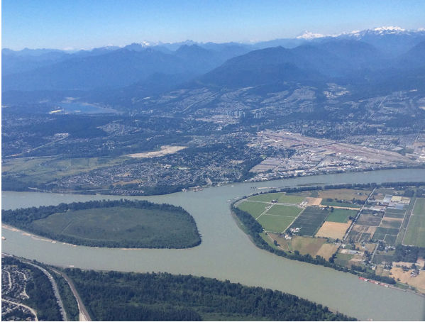
Metro Vancouver, BC, Canada.

28. The population size of a settlement depends on its roles in serving certain needs for its inhabitant and for its larger settlement system.