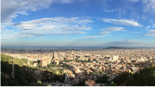
Barcelona, Spain.