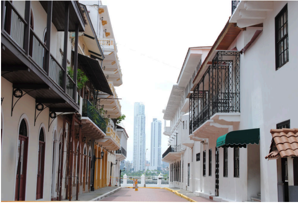
Panama City, Panama.