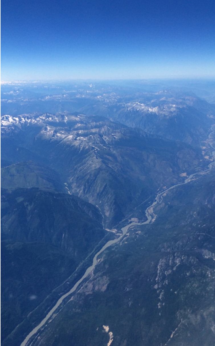
British Columbia, Canada