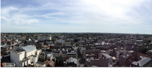
Arras, France.