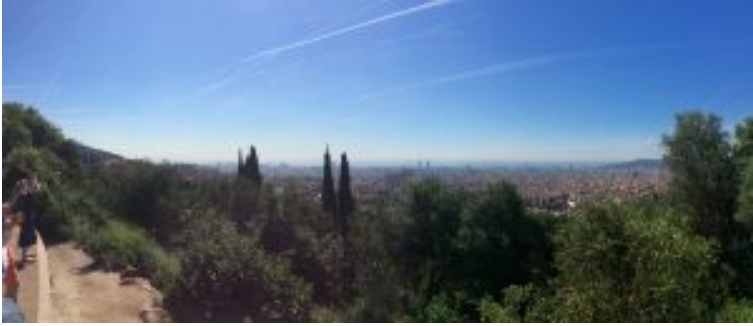
Barcelona, Spain.