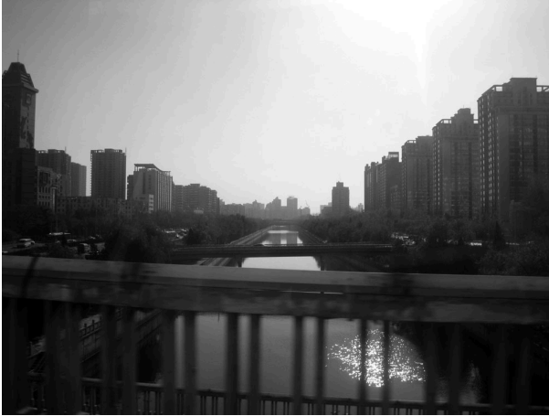
Beijing, China.

Countless people have inspired, informed and supported this book—some more directly than others, but all equally important. That being the case, I have to apologize in advance for not being able to name everybody individually. For those I miss, hopefully