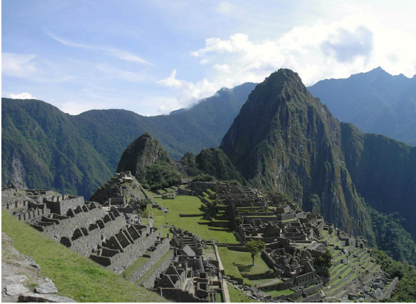
Machu Picchu, Peru.

30. The functions of a settlement depend on the geographic and topographic location, geologic conditions, technological development, population size, and the role within the larger settlement system.