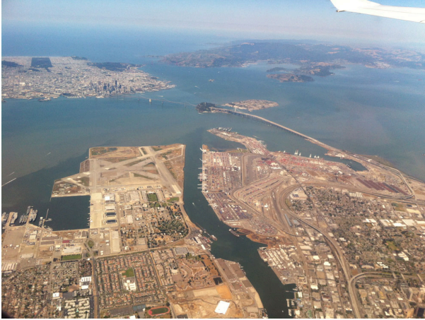
San Francisco, US.

40. The main force which shapes human settlements physically is centripetal—that is, the inward tendency towards a close interrelationship of all its parts.