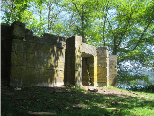
North Vancouver, BC, Canada.

15. The gradual death of a settlement begins when the settlement no longer serves and satisfies some of the basic needs of the its inhabitants or of the Society, in general. As people move they carry their values with them.