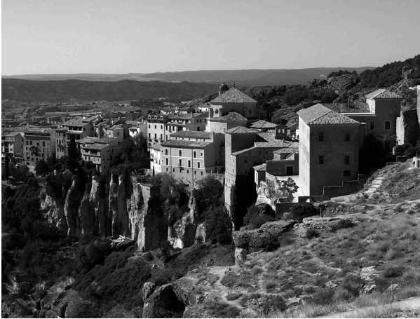
Cuenca, Spain.

Abu-Lughod, J. (May, 1987). The Islamic city: Historic myths, Islamic essence, and contemporary relevance. International Journal of Middle East Studies . Vol. 19(2), 155-176.