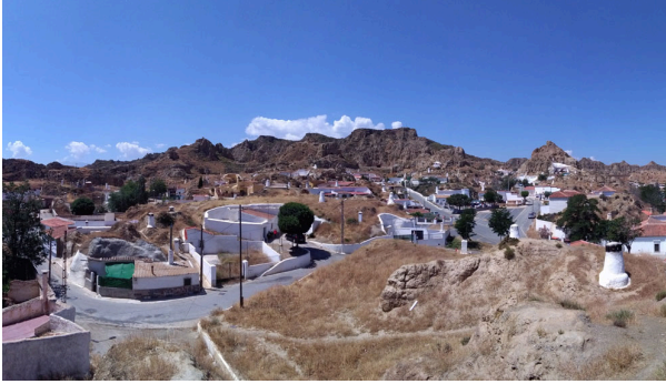
Guadix, Spain.

26. The geographic/topographic location of a settlement depends on the needs it must serve for itself (its inhabitants, natural setting, etc.) and the larger co-dependent settlement system to which it belongs.