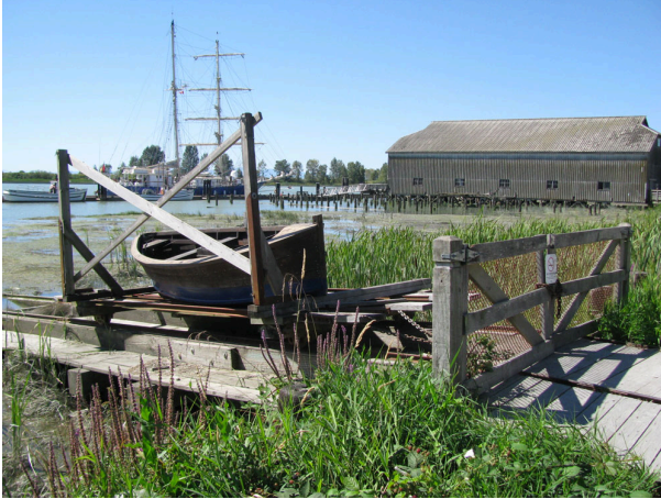
Richmond, BC, Canada.

7. The development and renewal of settlements is a continuous process. If it stops, conditions for its death are created, but how long it will take depends on many factors.