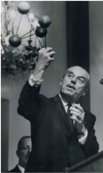
Constantinou Apostolou Doxiadis, 1967.

These works alone are enough to warrant labeling those decades as a golden age of insights around human settlements, but I beg your indulgence by adding a few more for good measure: Aldo Rossi's The Architecture of the City (1966), Robert Venturi and Denise Scott Brown's Learning from Las Vegas (1972), Edward T. Hall's The Hidden Dimension (1966), and Gordon Cullen's Townscape (1961), Jan Gehl's Life Between Buildings (1971), Henri Lefebvre's sharp The Production of Space (1974), and Oscar Newman's Defensible Space (1972). Each of these continues to be extremely influential in their respective fields.