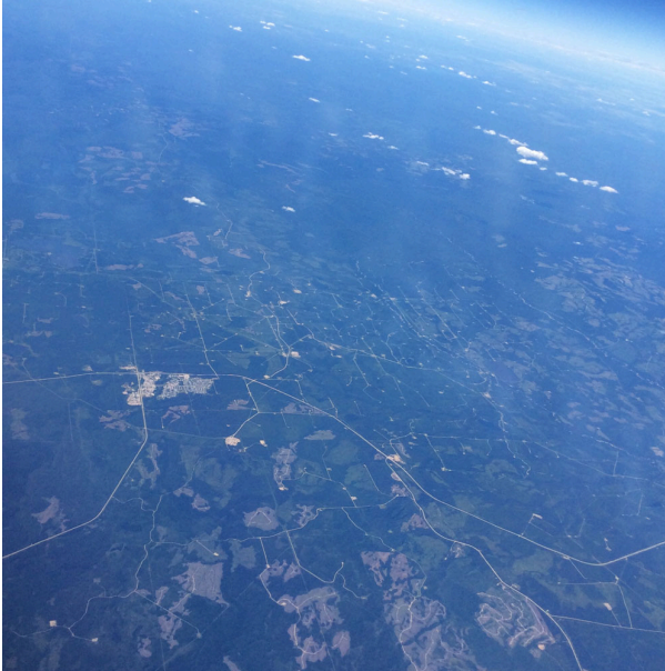
Northern Alberta, Canada.